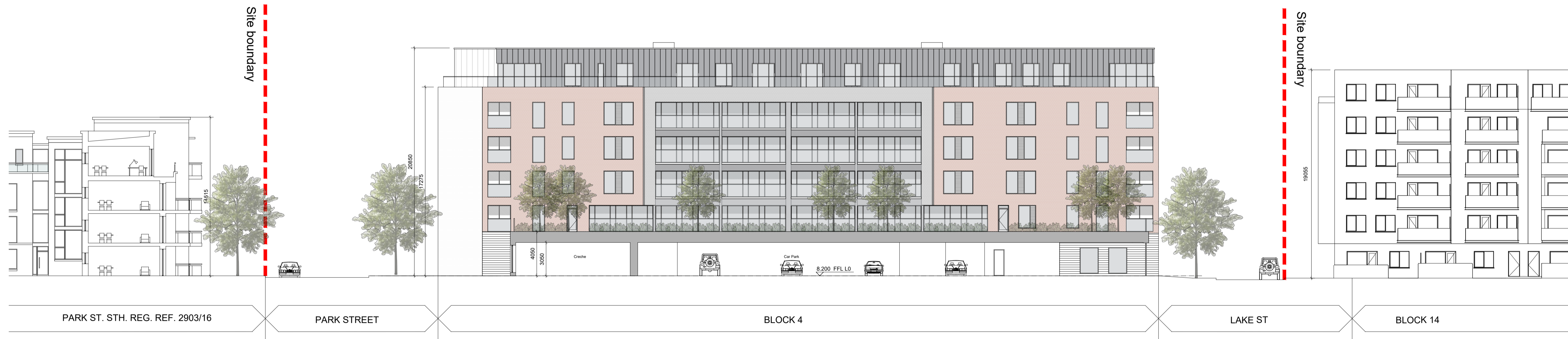
SECTION B-B/ SOUTH ELEVATION BLOCK A