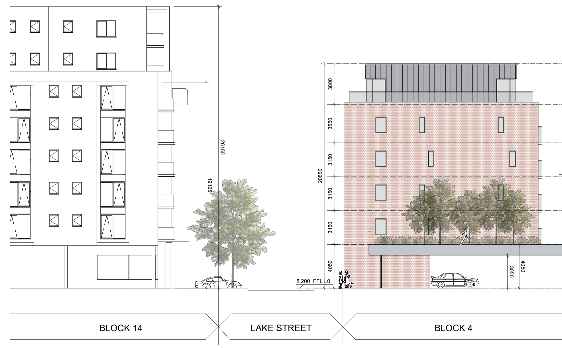
SECTIONAL ELEVATION C-C