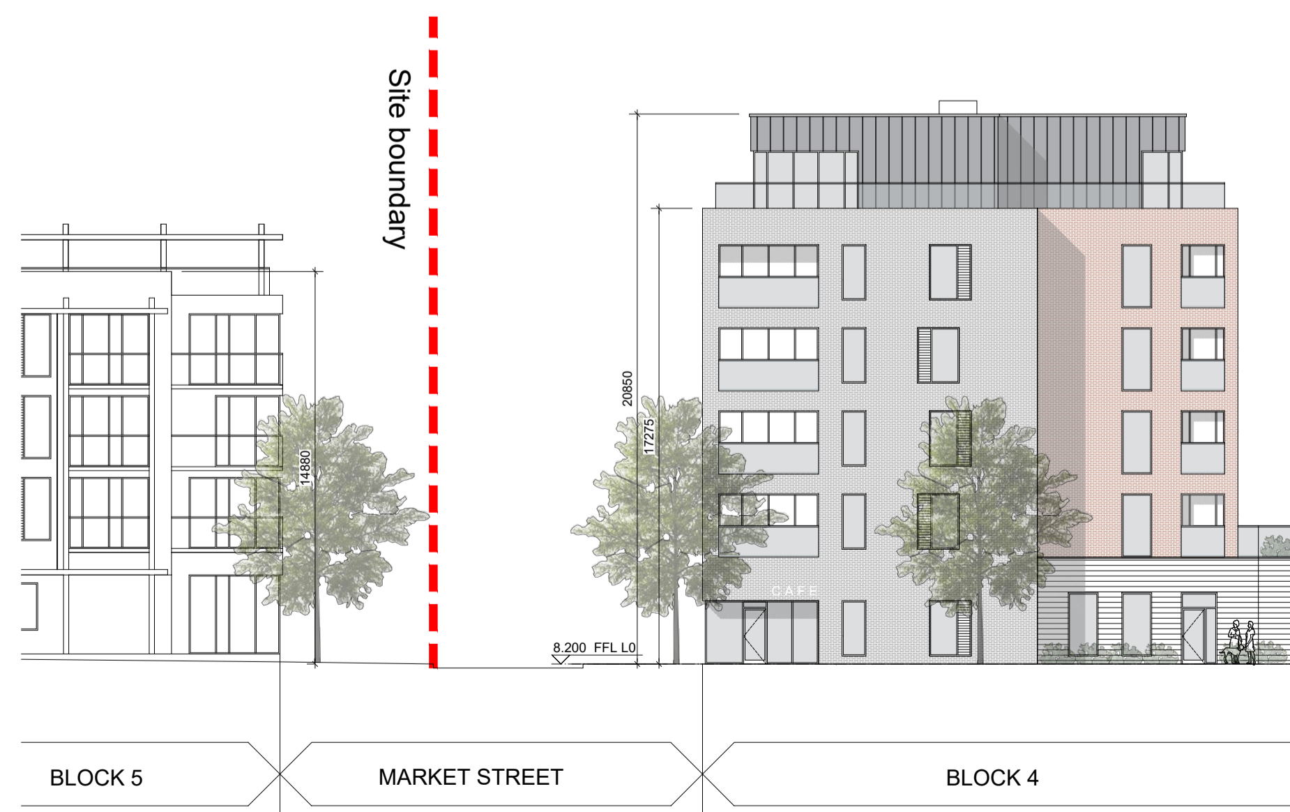
NORTH WEST ELEVATION BLOCK 4A TO PARK STREET